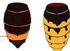
Asian hornet abdomen Native hornet abdomen