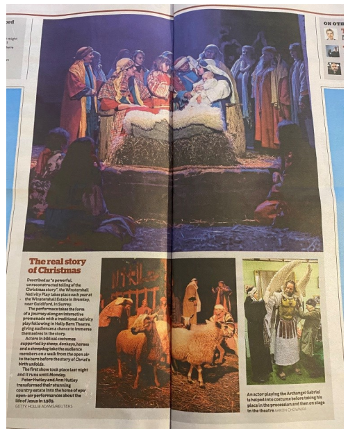
Spotted in the i in December

Be inspired by the real Nativity story at Wintershall in December.